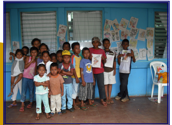
The children are very proud of their art work and loved coloring for hours. Hopscotch was fun, but not as much fun as blowing bubbles, coloring, and painting fingernails.