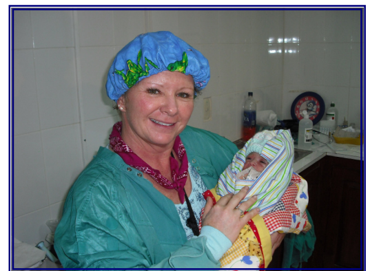
I was privileged to see two babies born. I was able to hold this little niña after her birth long enough to watch the color in her hands and face change while mom was getting settled, then hand mom her beautiful baby for the first time.