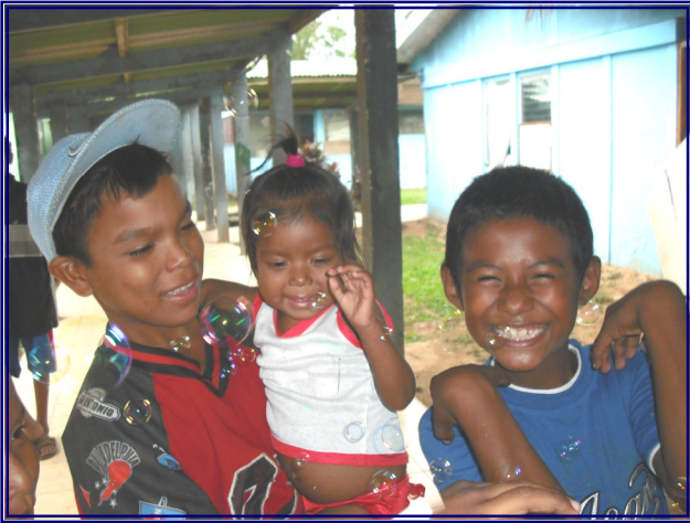
Please pray for this little girl; she is dying of aids.